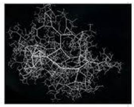
The representation of blood vessels using fractals